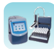
Total Organic Carbon 3800