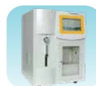
Liquid Particle Counter