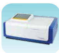
UV/VIS Spectro 2080+ Double Beam